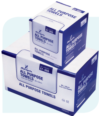
All Purpose Towels