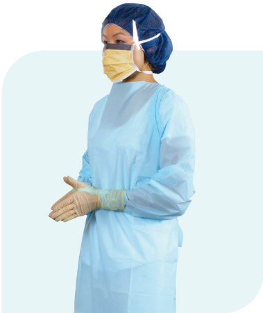
Liteback Thumb Secure Protective Gown