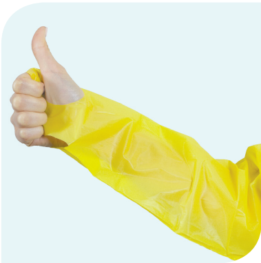
Thumb Secure Protective Gown