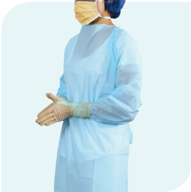
Liteback Thumb Secure Protective Gown